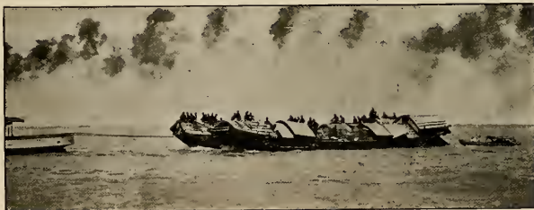
KANSAS TROOPS DISEMBARKING FROM THE TRANSPORT IN MANILA BAY.